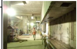
OTE duct work in progress at Pachaiyappa's station