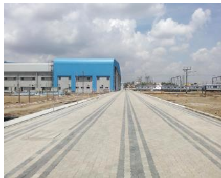
Paver works in front of stabling area

"Society exists only as a mental concept: in the real world there are only individuals." Oscar Wilde.