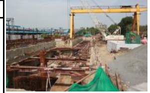
Work in progress at Egmore station