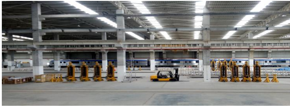
Work shop line