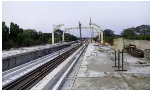
Nanganallur Road station