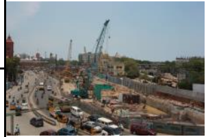
Work in progress at Central Metro