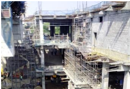
Guindy Metro station

Little Mount, Meenambakkam and Airport stations all structural works completed, block work, plastering and roof structural works in progress. MEP and fire fighting works in progress.