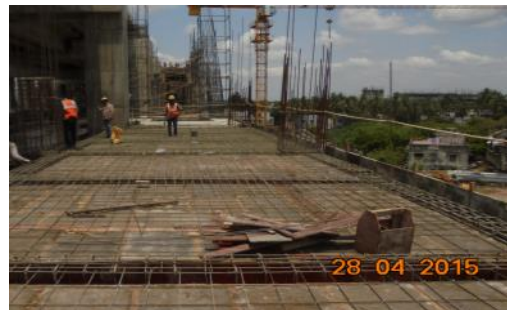
St Thomas Mount Metro Station