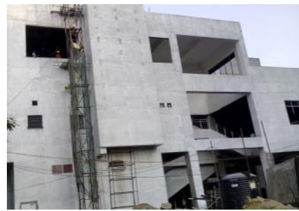
Little Mount station