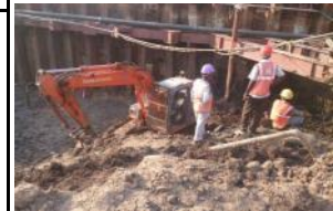
WORK IN PROGRESS AT Anna Nagar East STATION