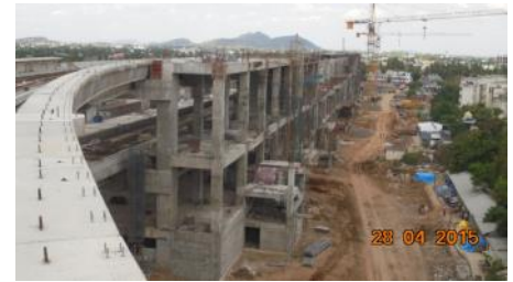
St Thomas Mount station