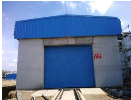
Under floor wheel workshop