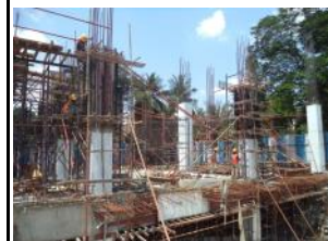
Ancillary building work in progress at Thirumangalam