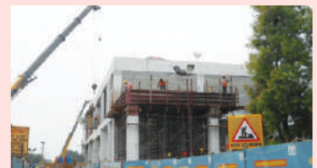
Work in progress at Anna Nagar East Station