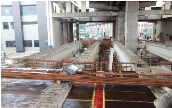
Deck slab preparation in progress at Vadapalani Flyover