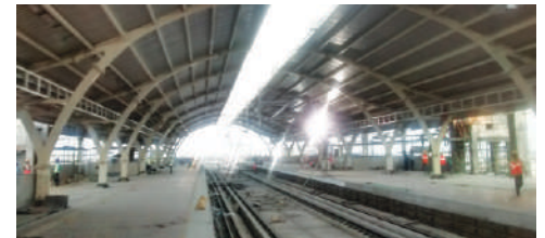
Work is in progress at St Thomas Mount Station