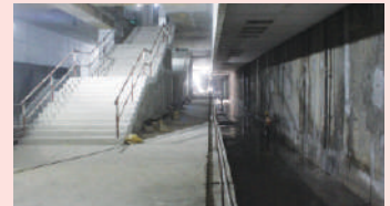
Work in progress at Washermenpet Station