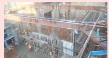
Work in progress at Anna Nagar Tower Station