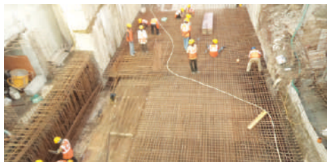
Rebar work of Roof slab at Entry-A at Nehru Park Station