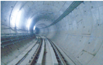
Thirumangalam Ramp to Thirumangalam Station finished track

Track work completed for entire depot length of 14606m and 41 numbers of turnouts were laid.