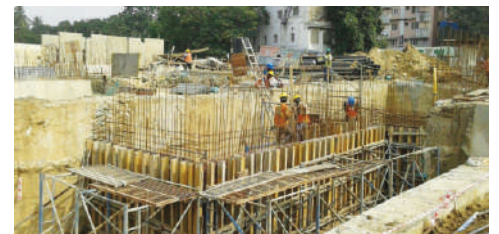
Shuttering for firemen Staircase wall work in progress at Pachaiyappa's College Metro Station