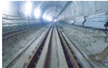
Finished track between Tirumangalam Station and Anna Nagar Tower Station