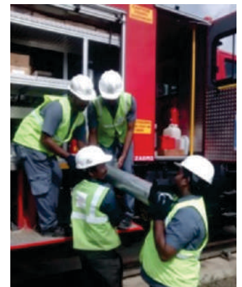
Unloading of re-railing equipment from RRV