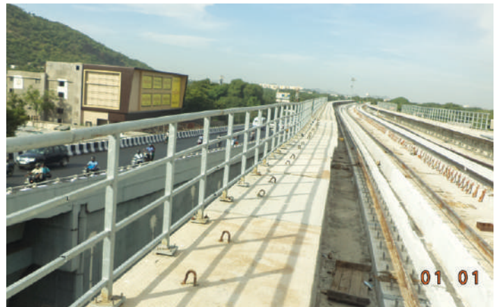
Hand rail installation work in progress near Meenambakkam station viaduct