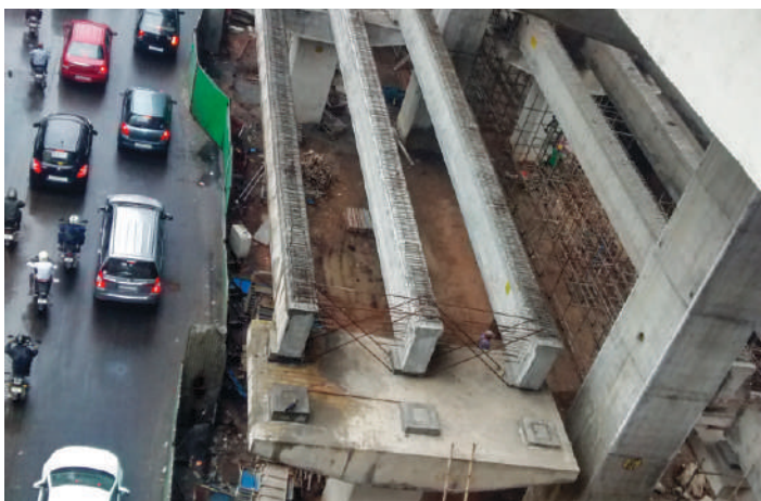
Erection of I-Girder in progress at Vadapalani Flyover