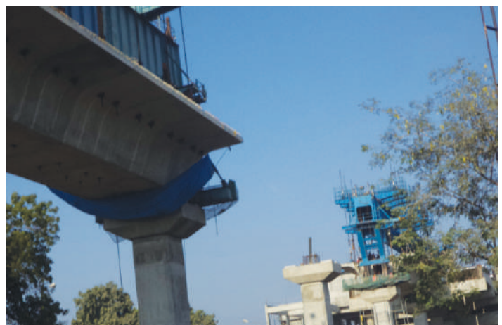
Viaduct work in progress between Nanganallur road and Airport