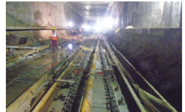
Track concreting in progress at Airport Box Section