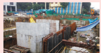
Work in progress at Thirumangalam Station