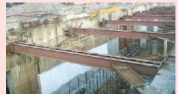
Work in progress at shenoy Nagar Station