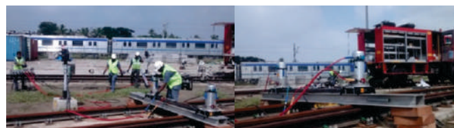
Setting up of beam and jacks and connecting to hydraulic control panel for re-railing operation

During the mock drill, the functionality of various Re-railing equipment such as Power packs, Hydraulic Jacks, Tilting cylinders, Spreader, cutter, Airbags, Rescue trolley etc. are checked and found to be in order.