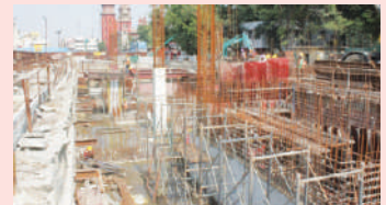
Work in progress at High Court Metro Station