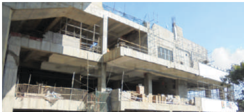
Work is in progress at Guindy Metro Station