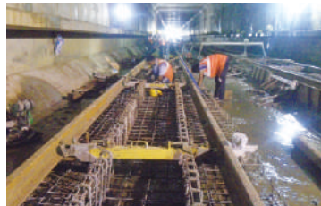
Rebar work in progress at Airport Box Section