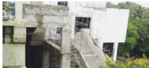
Work is in progress at Nanganallur Metro Station