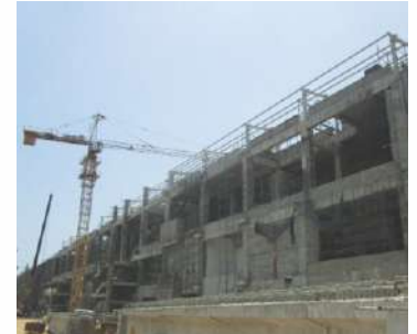
St. Thomas Mount Station