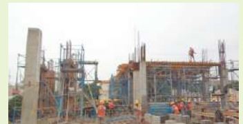
Work in progress at Kilpauk Station