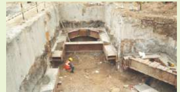
Work in progress at Nehru Park Station