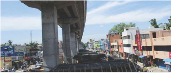
Vadapalani Flyover work in progress