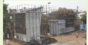
Work in progress at Washerment Station