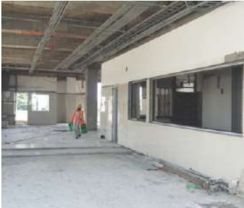
Little Mount Station