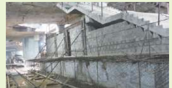
Work in progress at High Court Station