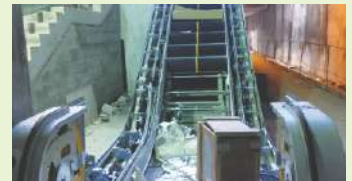
Work in progress at Shenoy Nage Station