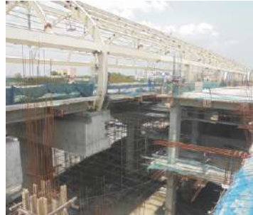
Guindy Metro Station