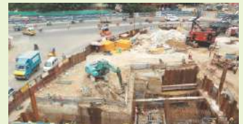
Work in Progress at Pachaiyappa's Station