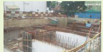
Work in progress at Anna Nagar Station