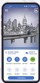
Chennai Metro Mobile App