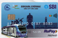
Singara Chennai Card (NCCMC)