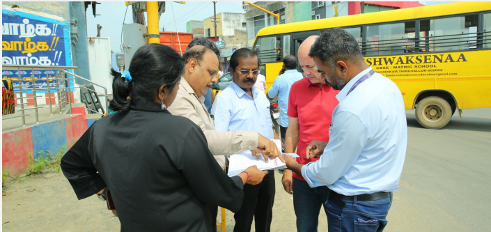
Airport-Kilambakkam corridor (15.46 km), including the Kilambakkam Bus Terminus, and the Pattabiram-Koyambedu via Avadi (21.76 km) on November 11, 2025

As part of the visit, the delegation inspected the major project stretches including: