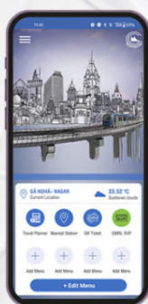
Chennai Metro Mobile App