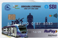
Singara Chennai Card (NCCM)