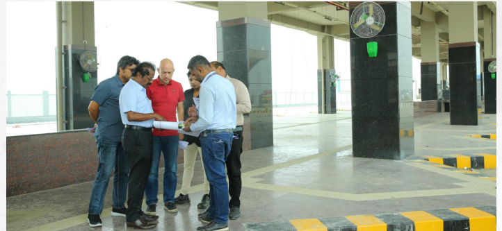
Poonamallee Bypass-Sunguvarchatram corridor (28 km) on November 12, 2025.